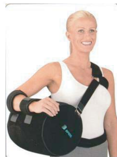
shoulder abduction pillow US$120.00