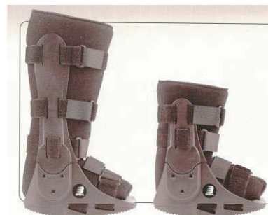
foam walker (with or without ankle articulation)