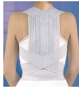
upright position support