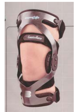
rigid knee brace