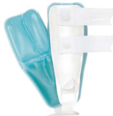
ankle stirrup (aircast type)