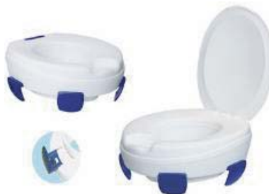
raising toilet seat