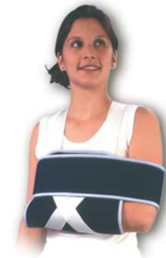
sling & swathe