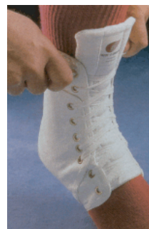
ankle support with lace