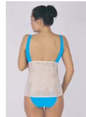
lumbosacral support with metal stays