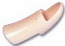
stax finger splint