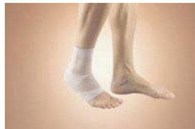
elastic ankle support