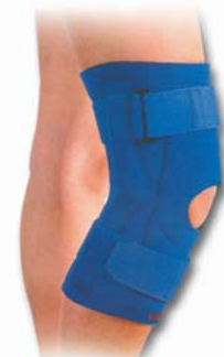
knee orthoses with free hinges