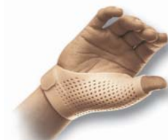
static or dynamic hand splint custom moulded