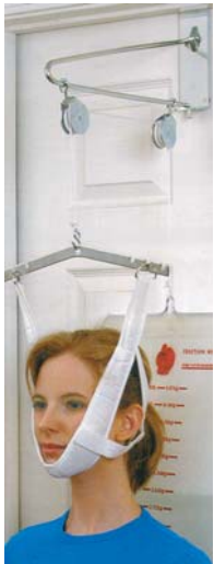
cervical traction unit