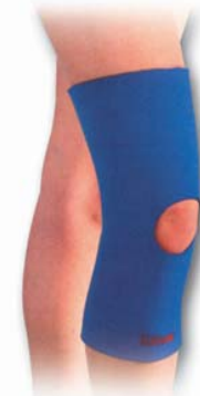
knee support with lateral stays