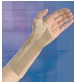
wrist orthoses with thumb spica