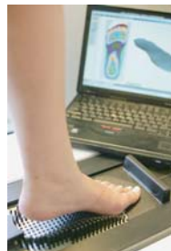
custom arch support